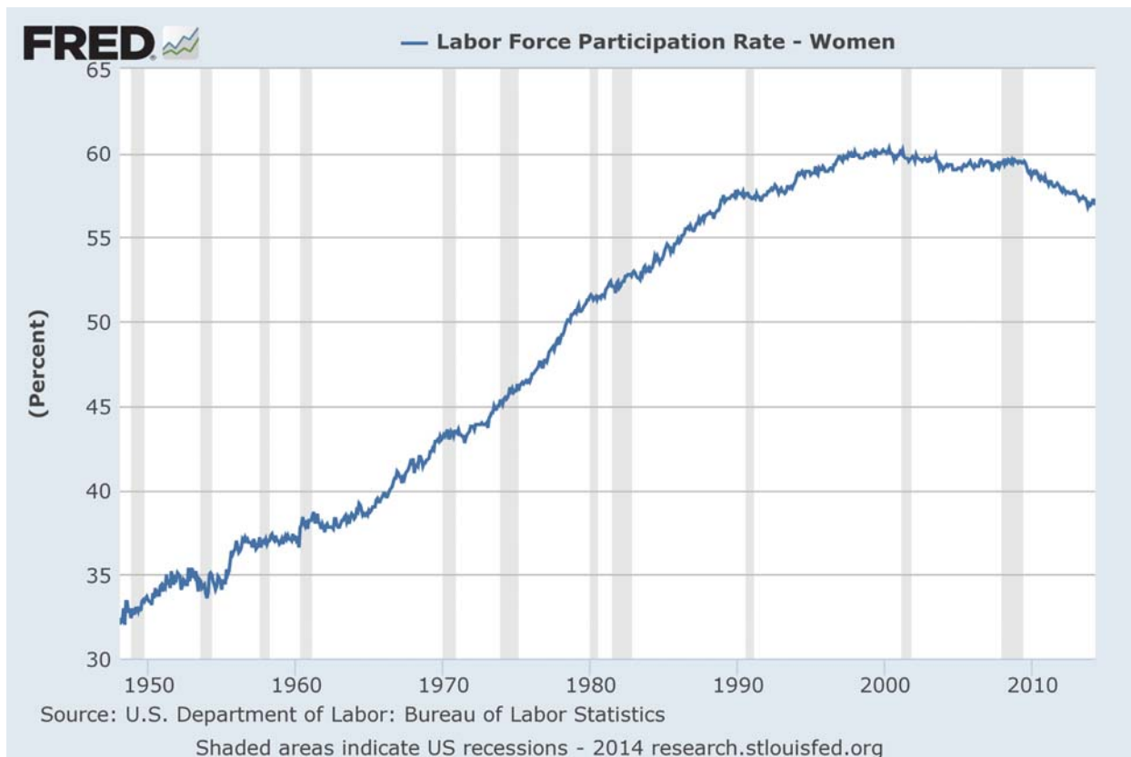
Chart 3 30