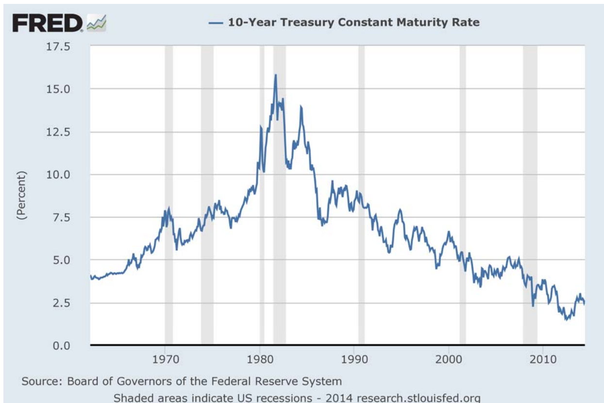
Chart 1 6

Interest rates can stay low for a long time, as we have seen in Japan, where they have been below 1 percent for over 20 years. Many now refer to a long-term low interest rate scenario as a “Japan” scenario.