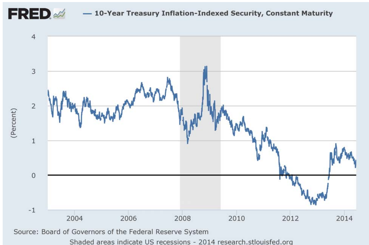
Chart 4 33

netting the rates in Chart 4 (10-year TIPS) and Chart 1 (10-year Treasury), an estimate for inflation expectations can be calculated. For example, at the end of April 2014 the 10-year CMT was 2.67 percent and the 10-year TIPS 0.49 percent, so expectations were for inflation of 2.18 percent.